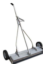
25" MAGNET BROOM P004335