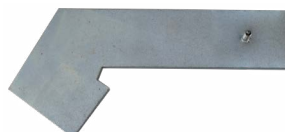
RIGHT SIDE LINER B20399