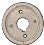
BLAST WHEEL HUB B20397