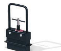
HANDHELD MAGNET 08400002