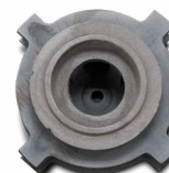
WHEEL KIT B20536K