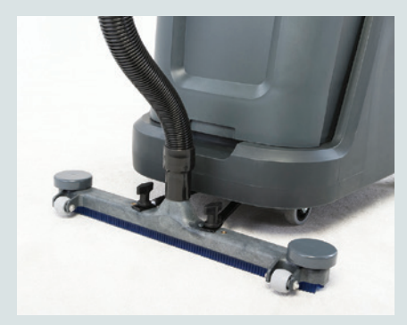
Front-mount squeegee is easy to install, and enables easy cleaning in both forward and backward directions. With a break-away design, the squeegee can be quickly engaged via the foot pedal.

The VL500 wet/dry vacuums offer simple and reliable operation. The 14 and 19 gallon configurations feature a balanced wide stance for superior maneuverability, while the lightweight design of the 9 gallon model ensures easy transportation. For enhanced performance, the VL500 series offers a variety of standard and optional accessories, ranging from hoses and wands to squeegees and dusting tools.