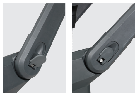
The VL500-75 features an easily adjustable handle to match operator height and maximize comfort.