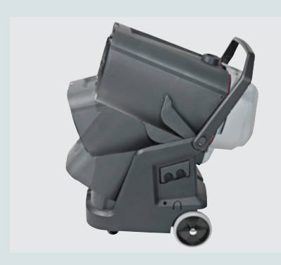
The VL500-75 and patent pending ERGO "tip n pour" design allows operators to easily empty the tank with 80% reduced effort. Standard "tip n pour" is available on the VL500-55 model.

* Standard on VL500-75; optional on VL500-55; not available on VL500-35.