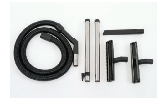
The VL500 series features a variety of standard and optional accessories, including: hose, wand, squeegee floor tool, brush floor tool, crevice tool, dusting tool and front-mounted squeegee.