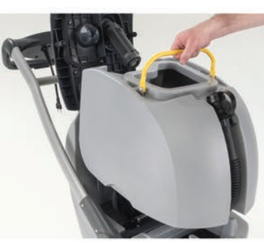
The removable, increased capacity tank along with the stowable handle make refilling much simpler.