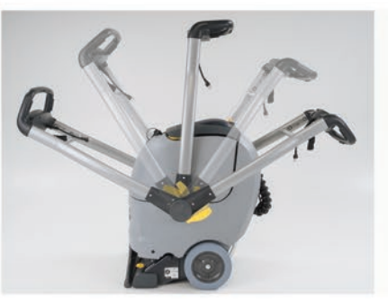
An adjustable handle allows for easy maneuverability, decreasing the need for backing into tight spaces. (ES400™ XLP shown)