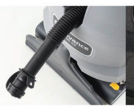
The front-mounted nozzle makes dumping much faster and easier for the operator.