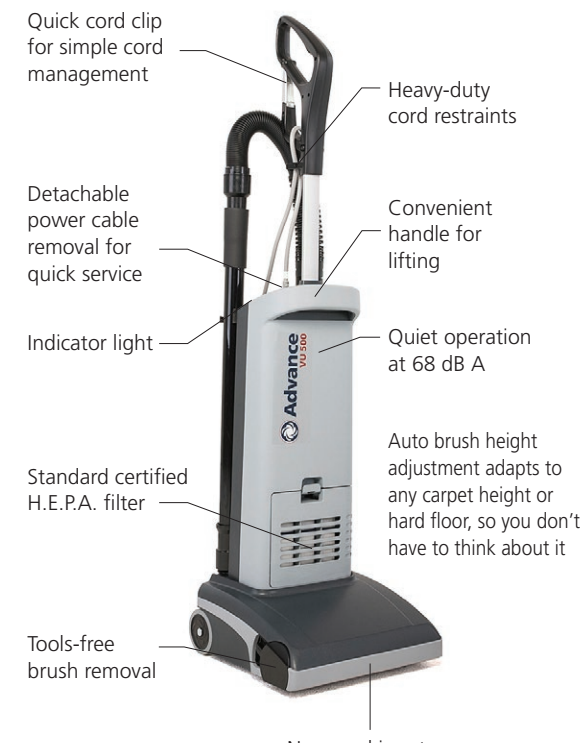
Non-marking, tear resistant bumper