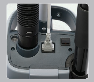
Detachable power cable for quick service