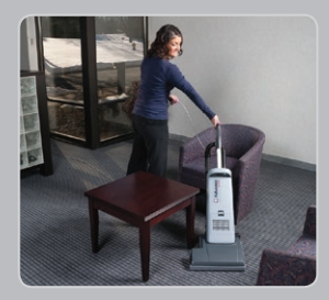
Radius Turning System permits quick, short turns in tight places