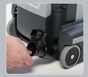
Easy access to clogs, minimizing potential downtime