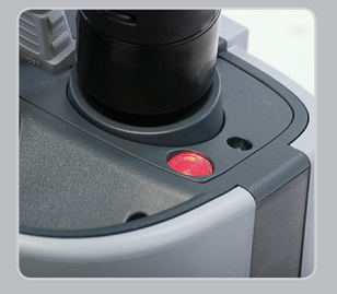
Indicator light shows when bag is full or vacuum is clogged