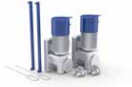
E09593 ENDLESS WINCH SYSTEM