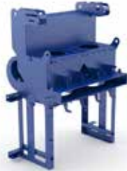
E09257 BLAST HOUSING