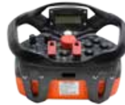
ON REQUEST REMOTE CONTROL SYSTEM