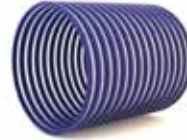
001112/STHW1.4 SUCTION HOSE Ø150 MM (MINIMUM 15 M)