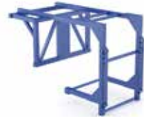
ON REQUEST RIGGING SYSTEM