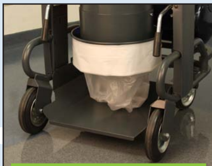
Longopac® bagging system available