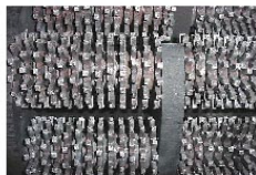
Cage W/ Steel Cutters