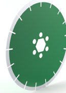
DIAMOND SHAVING BLADE E08714