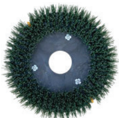
Part#110000211 \120 grit restoration brush

· Part#: 120000004 = Battery, charger, cleaning brush, and an external charging adapter.