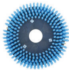
Part#110000214 .25mm - Med standard bristle